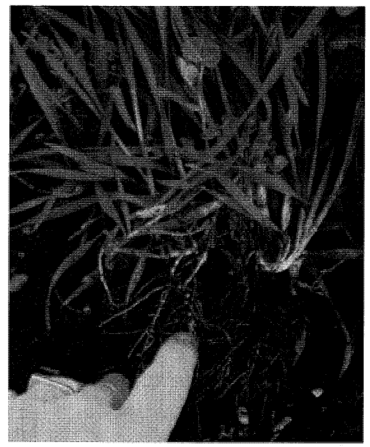
Figure 5.1 Cover Crop Roots Improve Soil Structure