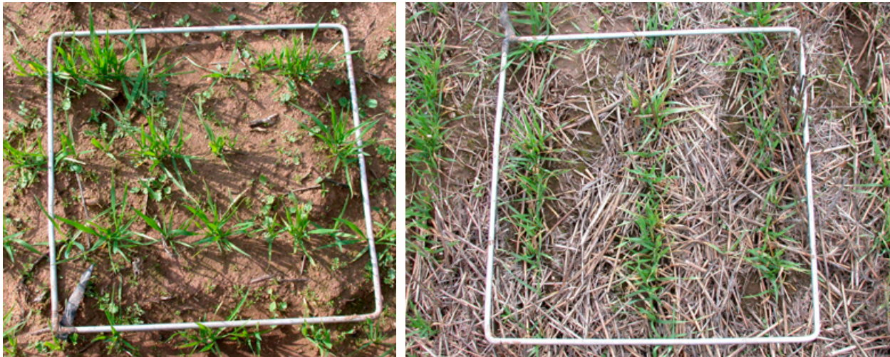
Figure 3. Comparison of wild radish emergence in conventional ( left ) and CT ( right ) plots in a small grain field in Denair, California.