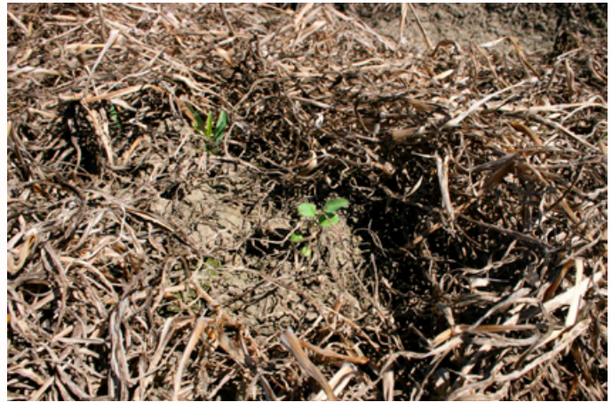
Figure 7. Postemergence herbicide weed escapes beneath the cover crop residue. The weeds survived due to shielding caused by the heavy surface residues.

been observed in a tomato CT system with small grain cover crops in Fresno County (Figure 7).