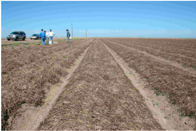
Figure 6. Residue of a small grain cover crop on beds of CT processing tomatoes in western Fresno County.