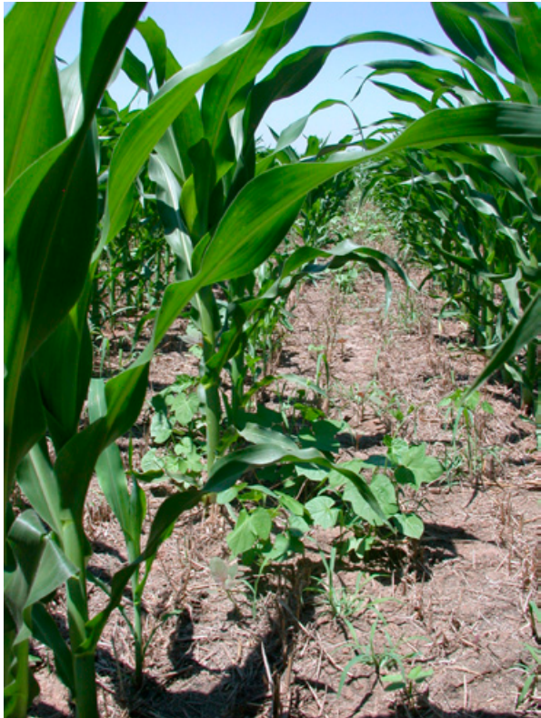
Figure 5. Annual morningglory escapes seen in a no-till Roundup Ready corn system in Tulare County.

resistant weeds. Studies by Wright and Vargas (2003) in the San Joaquin Valley have already shown weed shifts in Roundup Ready fields, with increases in annual morningglory over conventional tillage plots (Figure 5). Although CT systems are most often practiced in conjunction with HTC, conventional varieties, herbicides with different modes of action, or tillage may also be needed to manage herbicide-resistant weeds.