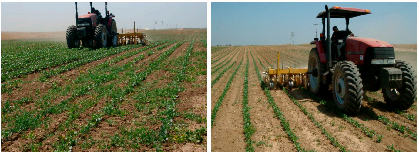
Figure 2. Successful elimination of field bindweed and other weeds in CT blackeye bean with cultivation in a CT system. Before cultivation (left) and after cultivation (right).

Wright and Vargas (2003) found that the most effective purple and yellow nutsedge control in cotton was achieved by a combination of glyphosate in a Roundup Ready system that involves mulching seed beds and cultivating two or three times using sweep-type cultivators. Similarly, Shrestha et al. (2003) found that cultivation was necessary for successful control of field bindweed ( Convolvulus arvensis L.) in CT blackeye beans (Figure 2). All of this means that some level of cultivation may be necessary for the management of “difficult-to-control” perennial weeds in certain cropping systems in California.