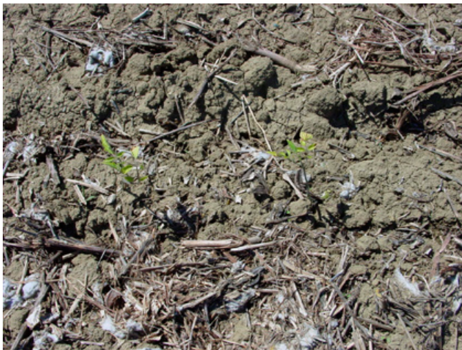
Figure 4. Injury to tomato by the carryover of the herbicide Staple from cotton in a CT plot at Five Points, California.

The potential for weed resistance to specific herbicides is always a concern with herbicide programs, and that concern increases with HTCs in a CT system. Roundup Ready promotes the continuous use of glyphosate, and we probably can expect that to induce shifts in weed species or the development of glyphosate-resistant weeds in HTC fields. Glyphosate-resistant horseweed or marehail, ( Conyza canadensis ) has been reported in no-till Roundup Ready corn-soybean rotations in the Midwest and mid-Atlantic regions of the United States (Mueller et al., 2003), in the cotton producing areas of the mid-South (Hayes and Steckel, 2005), and recently in California on canal banks with a history of repeated glyphosate use (Shrestha and Hembree, unpublished). The elimination of tillage takes away an important tool for managing herbicide-