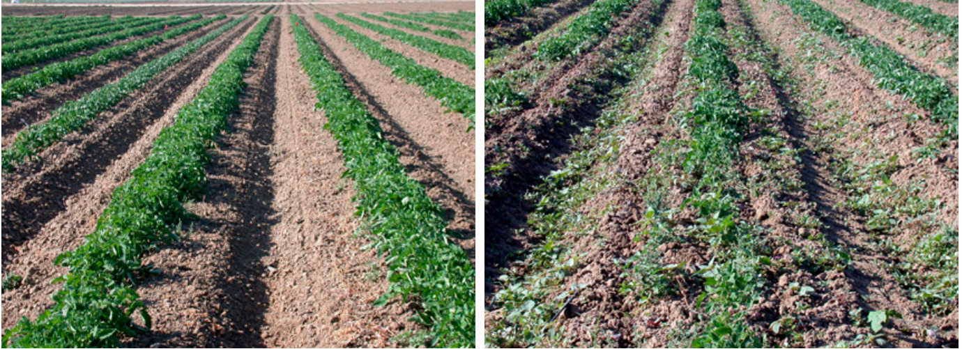
Figure 8. Weed populations in subsurface drip-irrigated ( left ) and furrow-irrigated ( right ) tomato plots in Five Points, California.