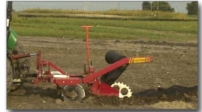
Figure 12. Static slicing machine

Trenching machines have been used for over twenty-five years to dig a trench for burying part of the filter fabric underground. Usually the trench is about 6" wide with a 6" excavation. Its walls are often more curved than vertical, so they don't provide as much support for the posts and fabric. Turning the trencher is necessary to maneuver around obstacles, follow terrain contours or property lines, and install upturns or J-hooks. But trenchers