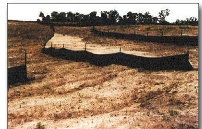
Figure 2. Create manageable sediment storage areas

Segment the site into manageable sediment storage areas for using multiple silt fence runs. The drainage area above any fence should usually not exceed a quarter of an acre. Water flowing over the top of a fence during a normal rainfall indicates the drainage area is too large. An equation for calculating the maximum drainage area length above a silt fence, measured perpendicular to the fence, is given in Fifield, 2011. Avoid long runs of silt fence because they concentrate the water in a small area where it will easily overflow the fence. The lowest point of the fence in Figure 4 is indicated by a red arrow. Water is directed to this low point by both long runs of fence on either side of the arrow. Most of the water overflows the fence at this low point and little sediment is trapped for such a long fence.