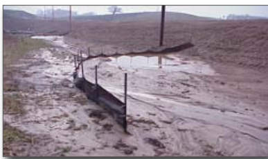
Figure 22. A silt fence full of sediment that needs maintenance

Silt fences should be inspected routinely and after runoff events to determine whether they need maintenance because they are full (Figure 22) or damaged by construction equipment. The ASTM silt fence specification