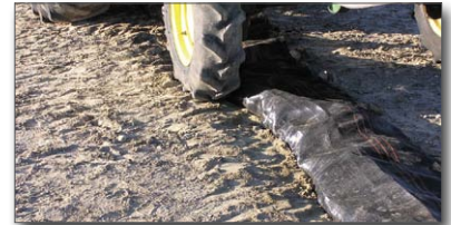
Figure 13. Tractor wheel compacting the soil