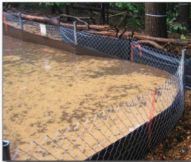
Figure 11. Chain link supported silt fence