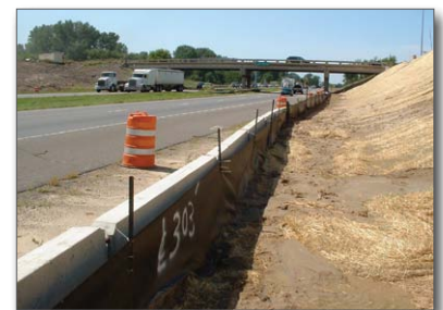
Figure 20. Silt fence protecting a highway and underground fiber optics cable

Highway example. Because of the proximity of a construction site to a highway, a concrete barrier was required by Minnesota's DOT to protect the highway and an underground fiber optic cable next to the highway from construction activities. The concrete barrier was used to support a silt fence along the perimeter of a large amount of dirt that was stock piled before being used for fill at a different location.