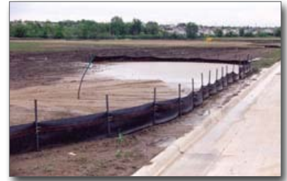
Figure 10. Gentle slopes may require a silt fence

of a gentle slope, if large (Figure 10), can be more important than its slope in determining sediment loss. A silt fence should not be placed in a channel with continuous flow (channels in Figures 8 and 9 don't have a continuous flow), nor across a narrow or steep-sided channel. But when necessary a silt fence can be placed parallel to the channel to retain sediment before it enters the watercourse.