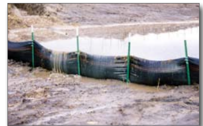
Figure 3. Water should not flow over the filter fabric during a normal rainfall