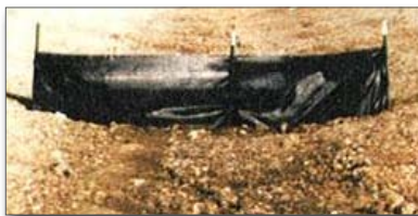
Figure 9. Poor installation, water can flow around the ends causing additional erosion

of a gentle slope, if large (Figure 10), can be more important than its slope in determining sediment loss. A silt fence should not be placed in a channel with continuous flow (channels in Figures 8 and 9 don't have a continuous flow), nor across a narrow or steep-sided channel. But when necessary a silt fence can be placed parallel to the channel to retain sediment before it enters the watercourse.