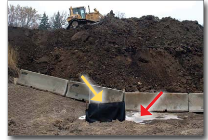
Figure 18. Front of silt fence on part of stock pile's perimeter

damage a conventional silt fence. The bottom of the porous fabric is held firmly against both the ground and base of precast concrete, highway, barriers by light-colored stones. An alternative installation would be having the concrete barriers rest directly on the bottom edge of the filter fabric, which would extend under the barriers about 10", so the barriers' weight will press the fabric against the ground to prevent washout. Water passing through the silt fence (red arrow in Figure 18) flows to a storm sewer culvert inlet, which is surrounded by a fabric silt fence (yellow arrows in Figures 17 and 18) that reduces the runoff's velocity and allows settling before the water is discharged to a creek.