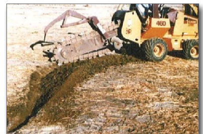
Figure 15. Trenchers make a wider excavation at turns