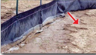
Figure 16. Poor compaction has resulted in infiltration and water flowing under this silt fence causing retained sediment washout

can't turn without making a wider excavation, and this results in poorer soil compaction, which allows infiltration along the underground portion of the fence. This infiltration leads to water seeking pathways under the fence, which causes subsequent soil