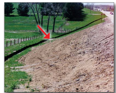
Figure 4. Avoid long runs of silt fence