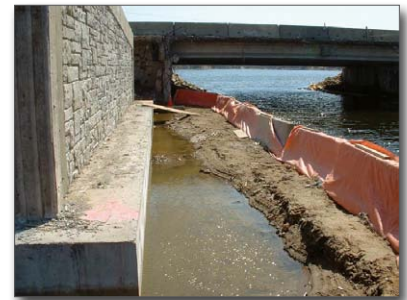
Figure 19. Silt fence for bridge abutment excavation

Bridge abutment example. During the construction of a bridge over a river between two lakes, an excavation on the river bank was needed to pour footings for the bridge abutment. The silt fence along the excavation's perimeter, composed of concrete highway barriers with orange filter fabric, was designed to prevent stormwater from washing excavated spoil into the river and to fend off the river during high flows. A portion of the orange filter fabric that has blown away from the concrete barriers shows the need to overlap and reinforce the joints where two sections of filter fabric are attached.