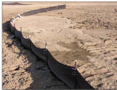
Figure 1. Silt fence retaining sediment

The purpose of a silt fence is to retain the soil on disturbed land (Figure 1), such as a construction site, until the activities disturbing the land are sufficiently completed to allow revegetation and permanent soil stabilization to begin. Keeping the