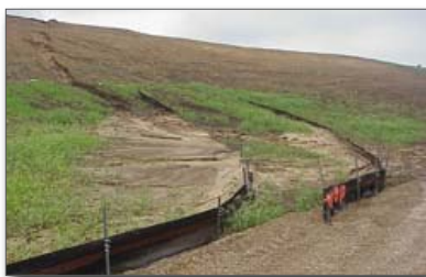
Figure 23. New silt fence below the old fence

(ASTM 2003) recommends removing sediment deposits from behind the fence when they reach half the height of the fence or installing a second fence. However, there are several problems associated with cleaning out silt fences. Once the fabric is clogged with sediment, it can no longer drain slowly and function as originally designed. The result is normally a low volume sediment basin because the cleaning process doesn't unclog the fabric. The soil is normally very wet behind a silt fence, inhibiting the use of equipment needed to move it. A back hoe is commonly used, but, if the sediment is removed, what is to be done with it during construction? Another solution is to leave the sediment in place where it is stable and build a new silt fence above or below it to collect additional sediment as shown in Figure 23. The proper maintenance may be site specific, e.g. small construction sites might not have sufficient space for another silt fence. Adequate access to the sediment control devices should be provided so inspections and maintenance can be performed.