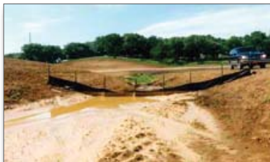
Figure 8. Proper installation, bottom of both ends are above the top of the middle