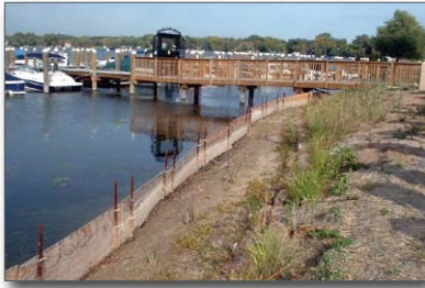
Figure 21. Silt fence protecting a lake shore