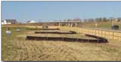
Figure 5. Use J-hook fences to break up long fence runs

Use J-hooks as shown in Figures 5 and 6, which have ends turning up the slope to break up long fence runs and provide multiple storage areas that work like mini-retention areas. If the fence doesn't create a ponding condition, it will not work well. The silt fence in Figure 7 doesn't pond water or retain sediment. Stormwater will run around the fence carrying sediment to the street, which will transport the water and its sediment load to the storm sewer inlet.