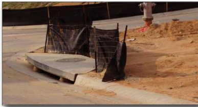
Figure 7. This silt fence doesn't work

Water flowing around the ends of a silt fence will cause additional erosion and defeat its purpose. The bottom of each end of the fence should be higher than the top of the middle of the fence (Figure 8). This insures that during an unusually heavy rain, water will flow over the top rather than around either end of the fence. Only fine suspended material will spill over the top, which is not as harmful as having erosion at the ends. When there is a long steep slope, install one fence near the head of the slope to reduce the volume and velocity of water flowing down the slope, and another fence 6–10 ft from the toe of the slope to create a sediment storage area near the bottom. A common misconception is that you only have to worry about water running off steep slopes. However, steep slopes may have a relatively small water collection area. The total drainage area