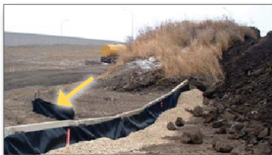
Figure 17. Back of silt fence on part of the stock pile's perimeter

Stock pile example. A stock pile of dirt and large rocks is shown in Figures 17 and 18 with a silt fence protecting a portion of its perimeter. Rocks that roll down the pile would likely